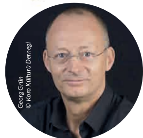
Georg Grün © Koro Kültürü Derneği